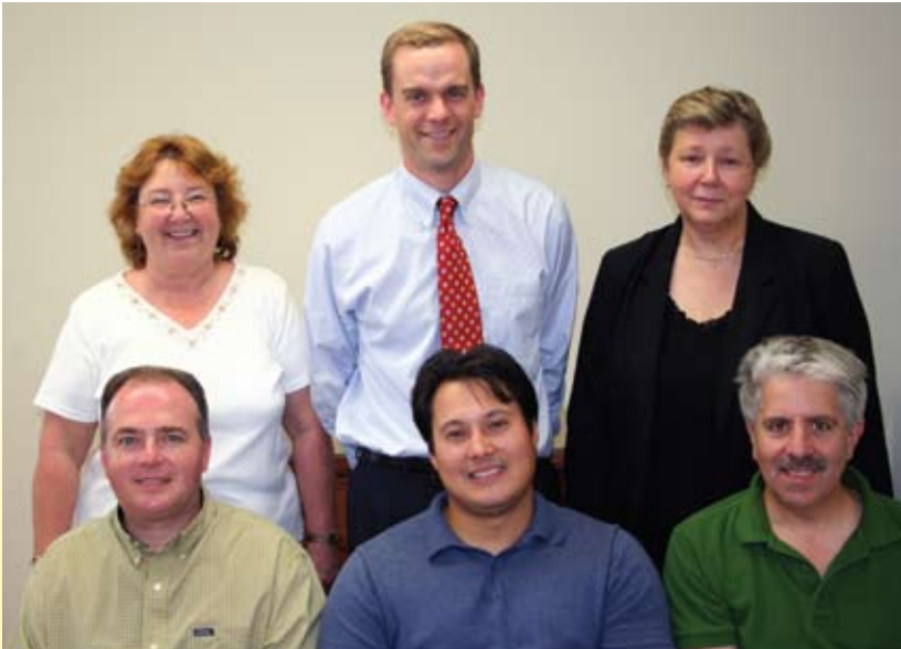
BerkshireRides 2006-2007 Board of Directors

Little more than a year later, in January 2006, the service expanded to include rides for those who needed to get to application appointments for heating fuel assistance