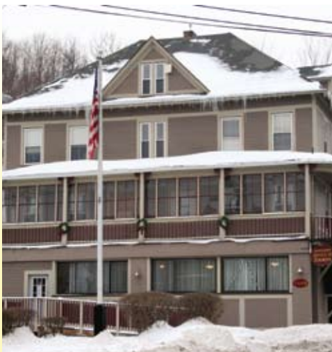
BerkshireRides, 6 West Street, North Adams, Massachusetts.