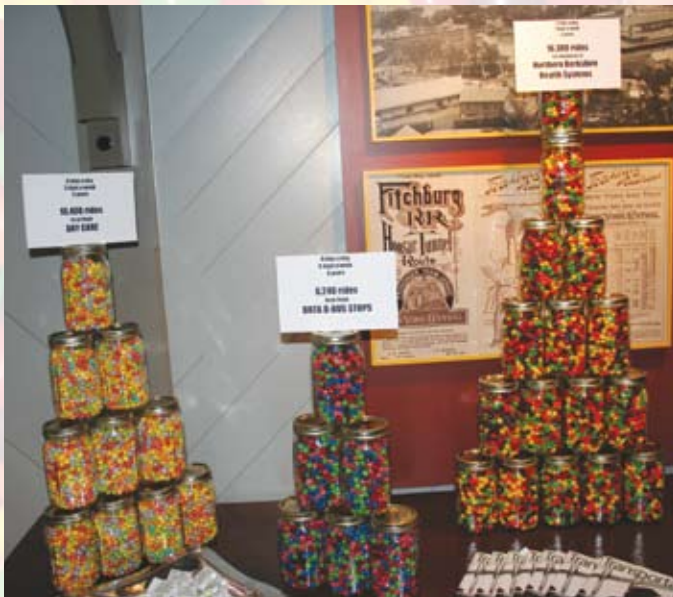
At BerkshireRides' five-year celebration, the "Skittle towers" represented total rides to select locations — 10,000 rides to daycares, 6,000 rides to BRTA bus stops, and 16,500 rides to bring employees to work at Northern Berkshire Health Systems.